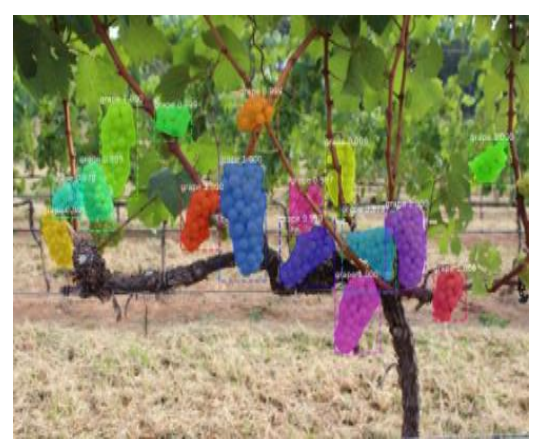
(a) Object Detection(b) Image SegmentationFigure 2: General architecture for grape bunch detection